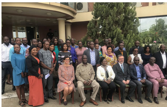
RCC Lomé supports Ghana to explore collaborative instruments | CiACA workshop in Accra, Ghana, 24-25 February

Since 2016, the UNFCCC secretariat has been providing technical support to jurisdictions considering adopting carbon pricing instruments under its Collaborative Instruments for Ambitious Climate Action (CI-ACA) 4 workstream.