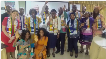
Participants celebrate the outcome of the youth ACE hub workshop in Ghana | 25-26 February 2020