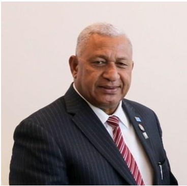
H.E. Mr. Frank BAINIMARAMA Fiji (Asia-Pacific)