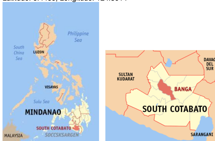
Figure A.2: Map and situation of Banga, South Cotabato in the archipelago of the Philippines