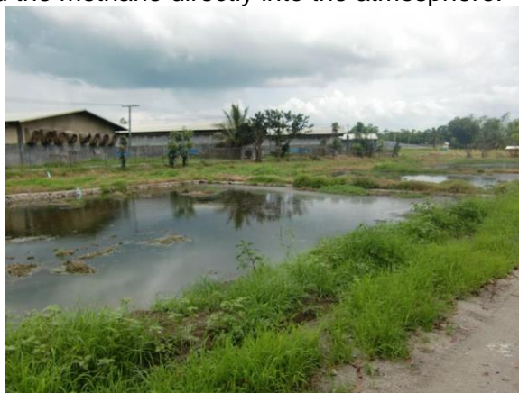
Biotech Farms' open anaerobic lagoons

The wastewater was stored indefinitely as there was no discharge as validated on-site. The open lagoons released the methane directly into the atmosphere.