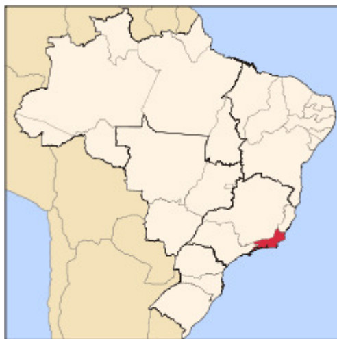
Figure 1: Localization of Rio de Janeiro State

The Providência SHP will be located on the Preto river, with geographical coordinates 22°15' S and 42°54'W, or, in decimal coordinates -22,25 latitude and -42,9 longitude, in Teresópolis city, Rio de Janeiro State, southeast region, Brazil.