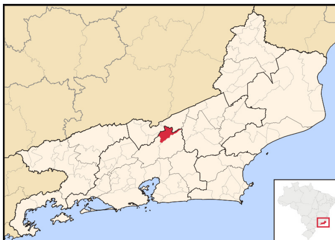
Figure 3: Localization of Teresópolis municipality