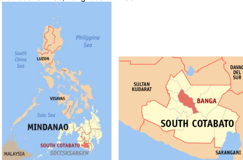
Figure A.2: Map and situation of Banga, South Cotabato in the archipelago of the Philippines