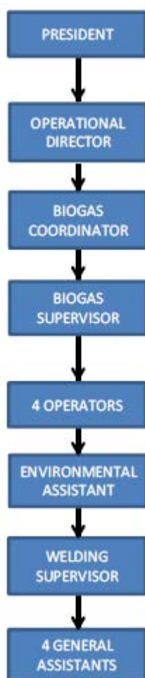
Figure 3 - Estre Ambiental S/A's organizational structure

All the measurement instruments will be subject to regular calibration as per manufacturer's specifications or, in the absence of manufacturer specifications and in the absence of official standards and when applicable, the calibration frequency will be defined by the PP based on good practices in the market. The LFG coordinator will be responsible for checking the equipment's proper working conditions, as well as checking and storing up the calibration certificates and records. The calibration frequencies will be in line with the manufacturer's specifications.. Calibration certificates will be kept for all the equipment during the crediting period and two years after.