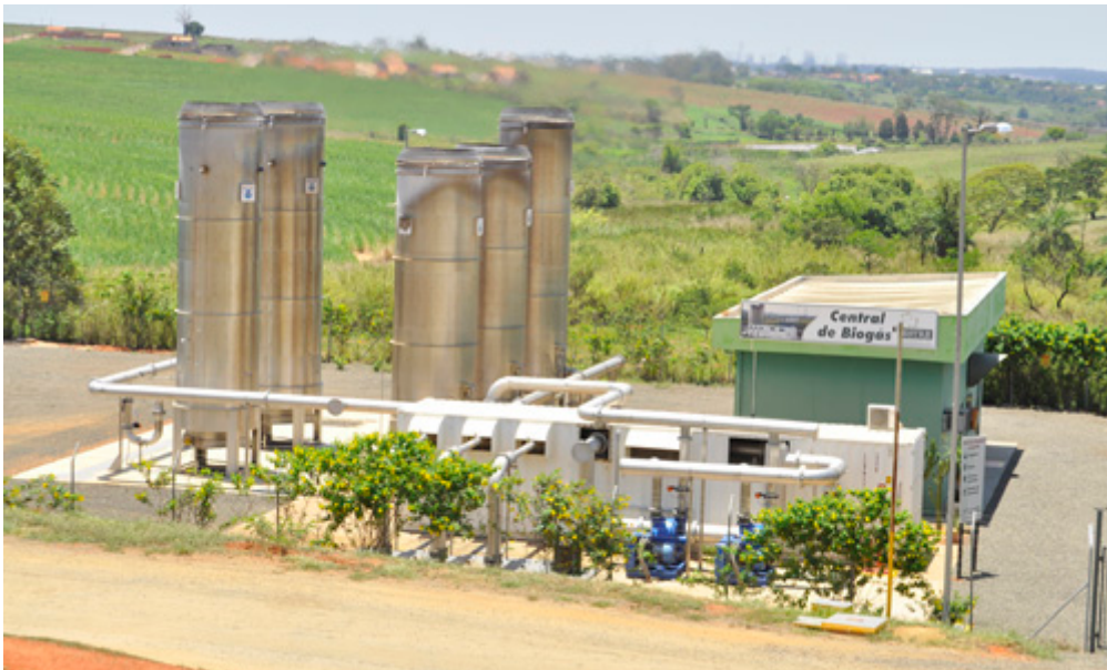
Figure 1 – Partial view of the LFG destruction station

In general, the project activity was implemented and has operated under full conformance with the previously conceived project design as outlined in the registered PDD.