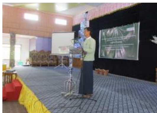
Figure 4. Presentation of the project overview