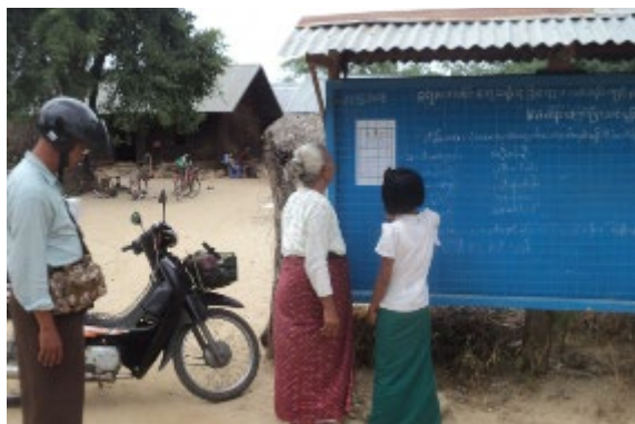
Figure 1. Invitation poster

During the stakeholder questions and feedback session, the attendees raised questions and comments. The organizers of the event – the CME, CI, manufacturer, consultant – responded to all questions and comments at the event as summarized in the Section E.2 below. The presentation and responses were provided with non-technical terms to ensure clear understandings by the attendees.