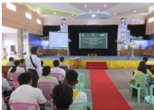
Figure 3. Presentation of the project overview