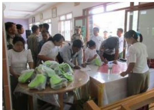
Figure 2. Registration to the event