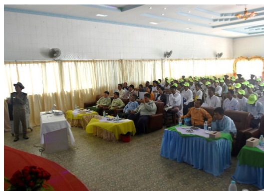
Figure 2. Attendees listening to the presentation