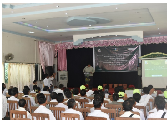
Figure 3. Presentation of the project overview