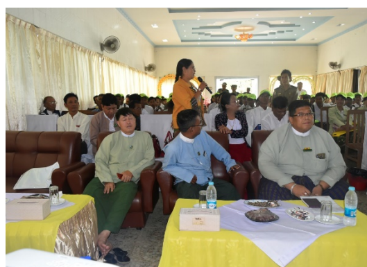
Figure 4. Local stakeholder raising comment