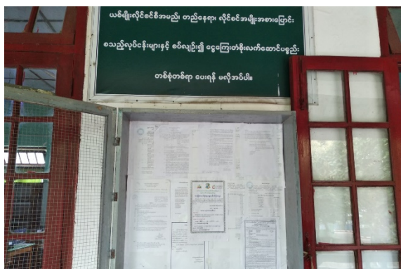
Figure 1. Invitation poster