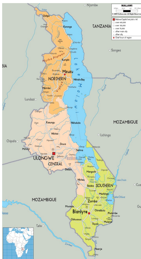
Pic. 1. Map of Malawi.