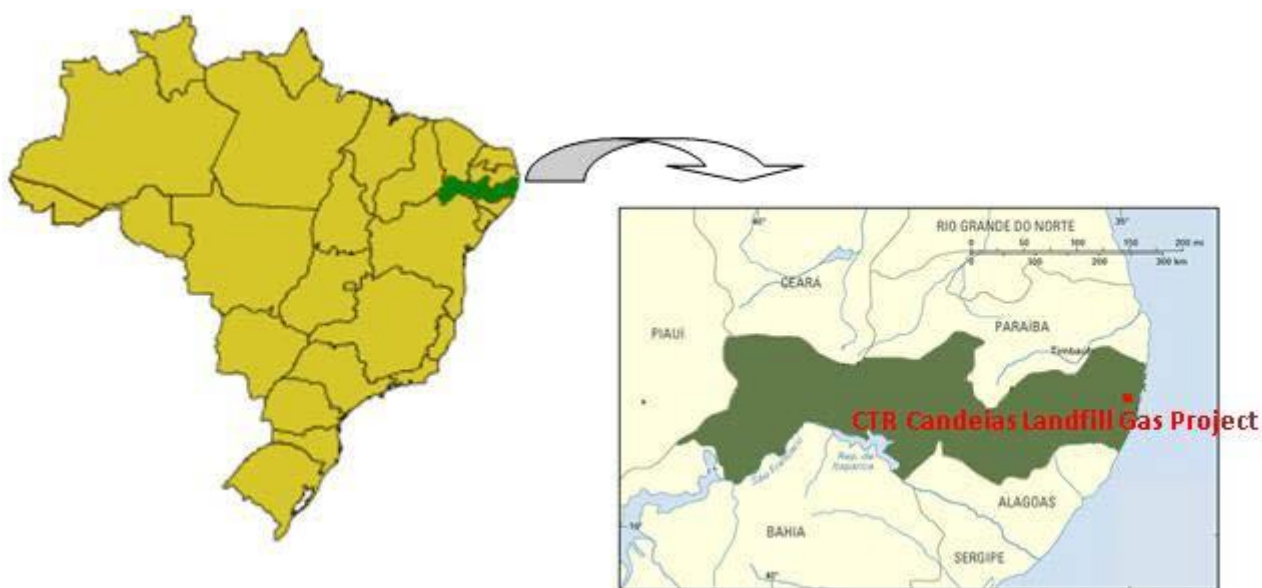
Figure 1 - Location of the CTR Candeias Landfill Gas Project

The picture below presents the detailed location of the landfill