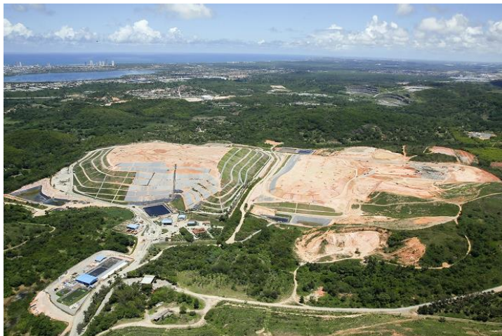
Figure 2 – Panoramic view of the CTR Candeias Landfill Gas Project