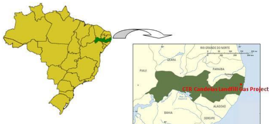
Figure 1 - Location of the CTR Candeias Landfill Gas Project

The project site is located in the Municipality of Jaboatão dos Guararapes in the Recife Metropolitan Area. Several poor communities are located in the vicinity of the project. The landfill is strategically situated close to three major cities in the state of Pernambuco: Recife, Jaboatão dos Guararapes and Cabo de Santo Agostinho. Due to its central location, the landfill will potentially provide services to a metropolitan area of 3.8 million inhabitants. The site, which is located at coordinates Latitude: - 8.164258; Longitude: -34.985286, is shown on figure below.