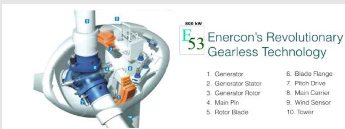
Figure: Enercon make E-53 Diagram.

Enercon (India) Ltd has secured and facilitated the technology transfer for wind based renewable energy generation from Enercon GmbH, has established a manufacturing plant at Daman in India, where along with other components the "Synchronous Generators" using "Vacuum Impregnation" technology are manufactured. Diagram of main component of Enercon make E-53 is shown in below picture:-