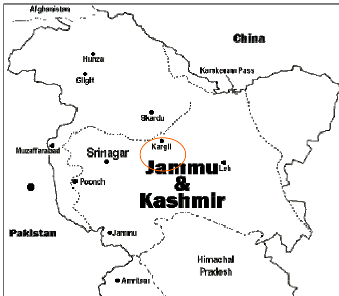
Figure 2: Location of Kargil District in Jammu & Kashmir

Kargil District, where Chutak Project is located, within Jammu & Kashmir State can be seen in Figure 2.