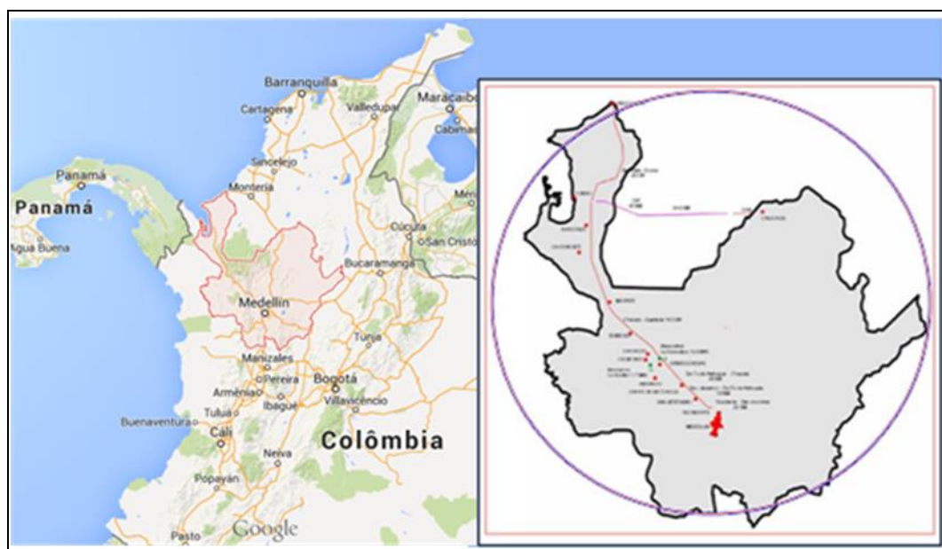
Figure 1: Location of Project Activity

Both plants are connected to Chorodó substation at 44kV 1 . Location -76.14°; 6.85° (-76°08'16.50"; 6°50'53.93").