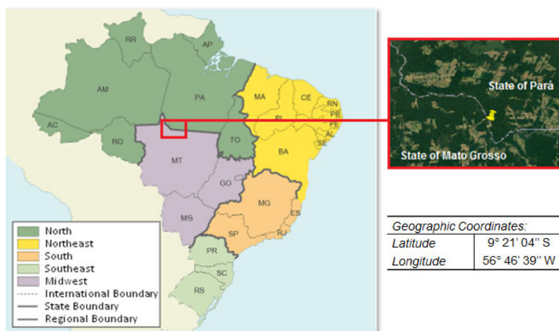
Figure 1 – UHE Teles Pires location and geographic coordinates

The Project is located in Teles Pires River, between the cities of Paranaita (MT) and Jacareacanga (PA), Brazil, under the following coordinates 2 :