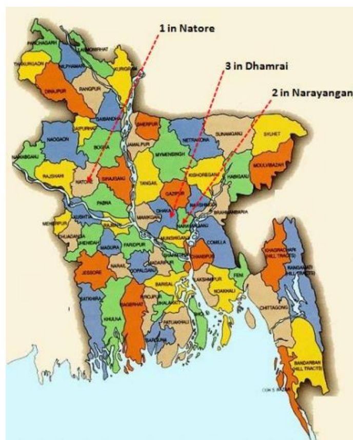
Figure 1: Map showing location of project kilns and the distribution of brick making activities