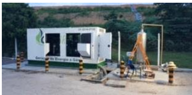
Figure 1- Detail of the biogas generator

A biogas generator was installed at Manaus Landfill Gas Project on May 26, 2019. The generator CHP300 use biogas as fuel to generate electricity only to supply landfill demand.