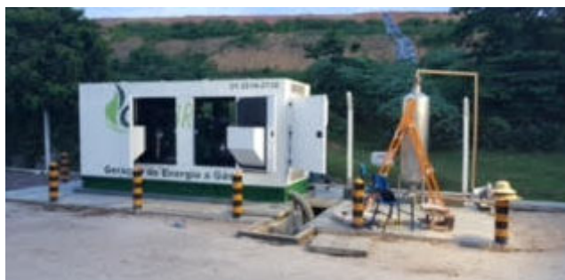
Figure 1– Detail of Biogas Generator

A biogas generator was installed at Manaus Landfill Gas Project on May 26, 2019. The generator CHP300 use biogas as fuel to generate electricity only to supply landfill demand.