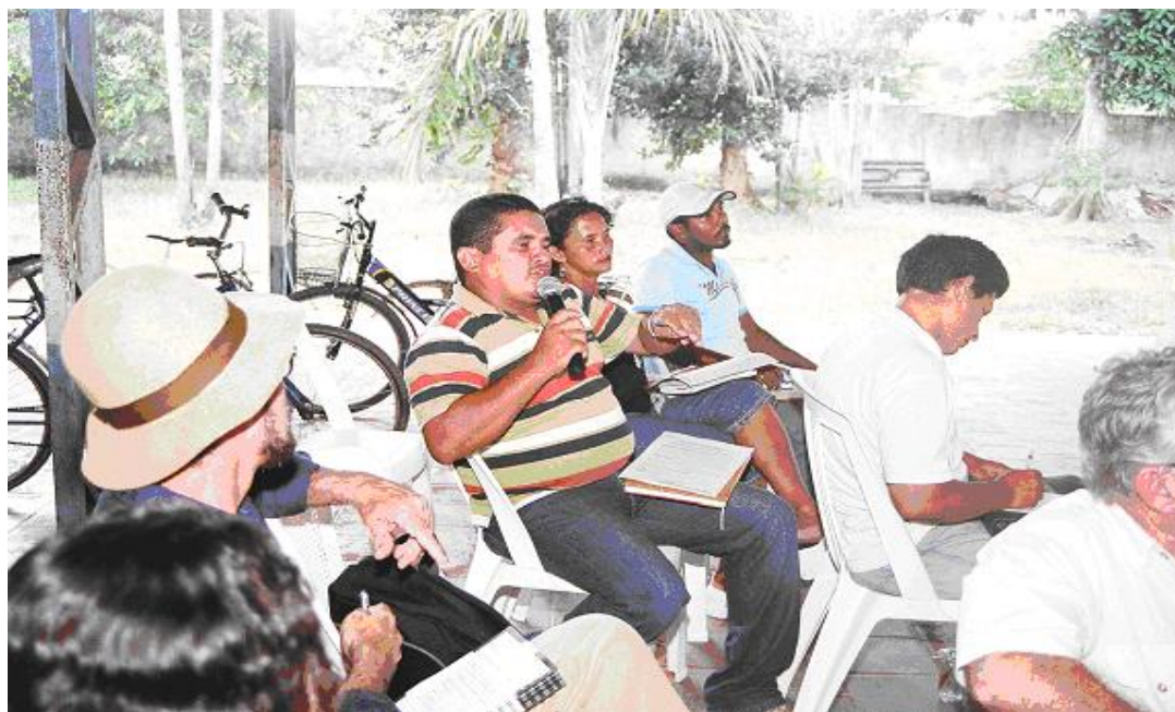
Figure 2: Attending audience asks questions at the public meeting project presentation