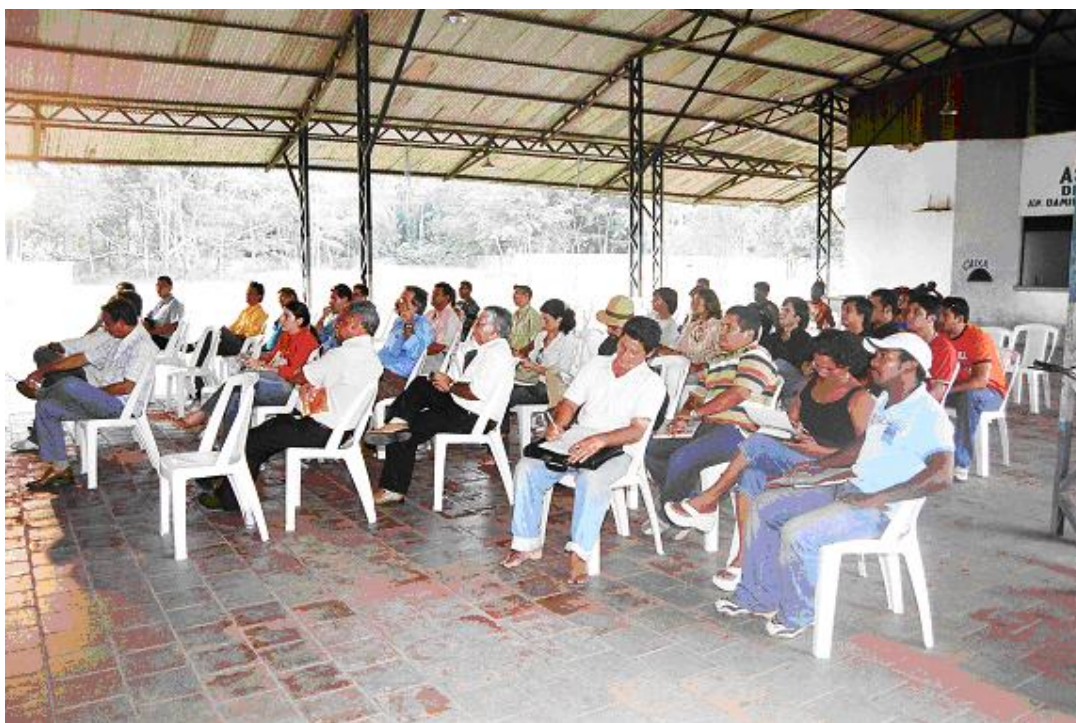
Figure 4: Audience at the public meeting in Belem