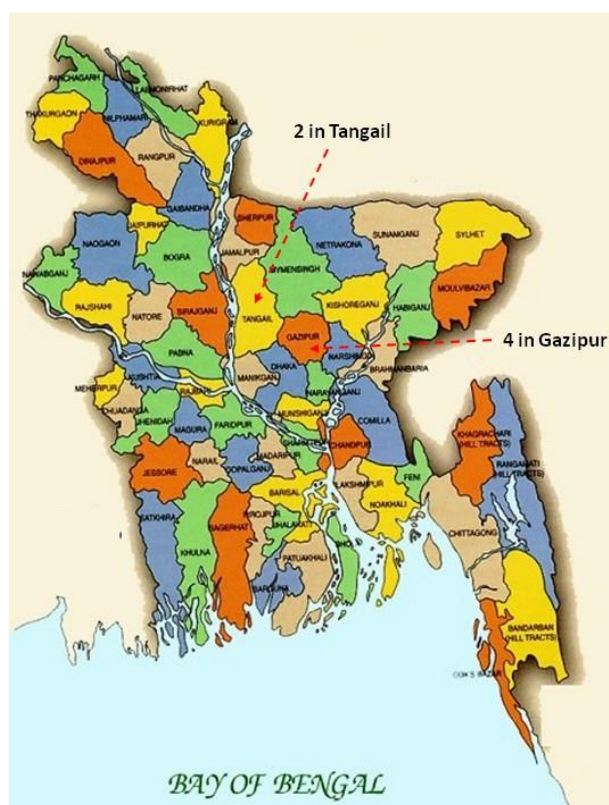
Figure 1: Map showing location of project kilns and the distribution of brick making activities