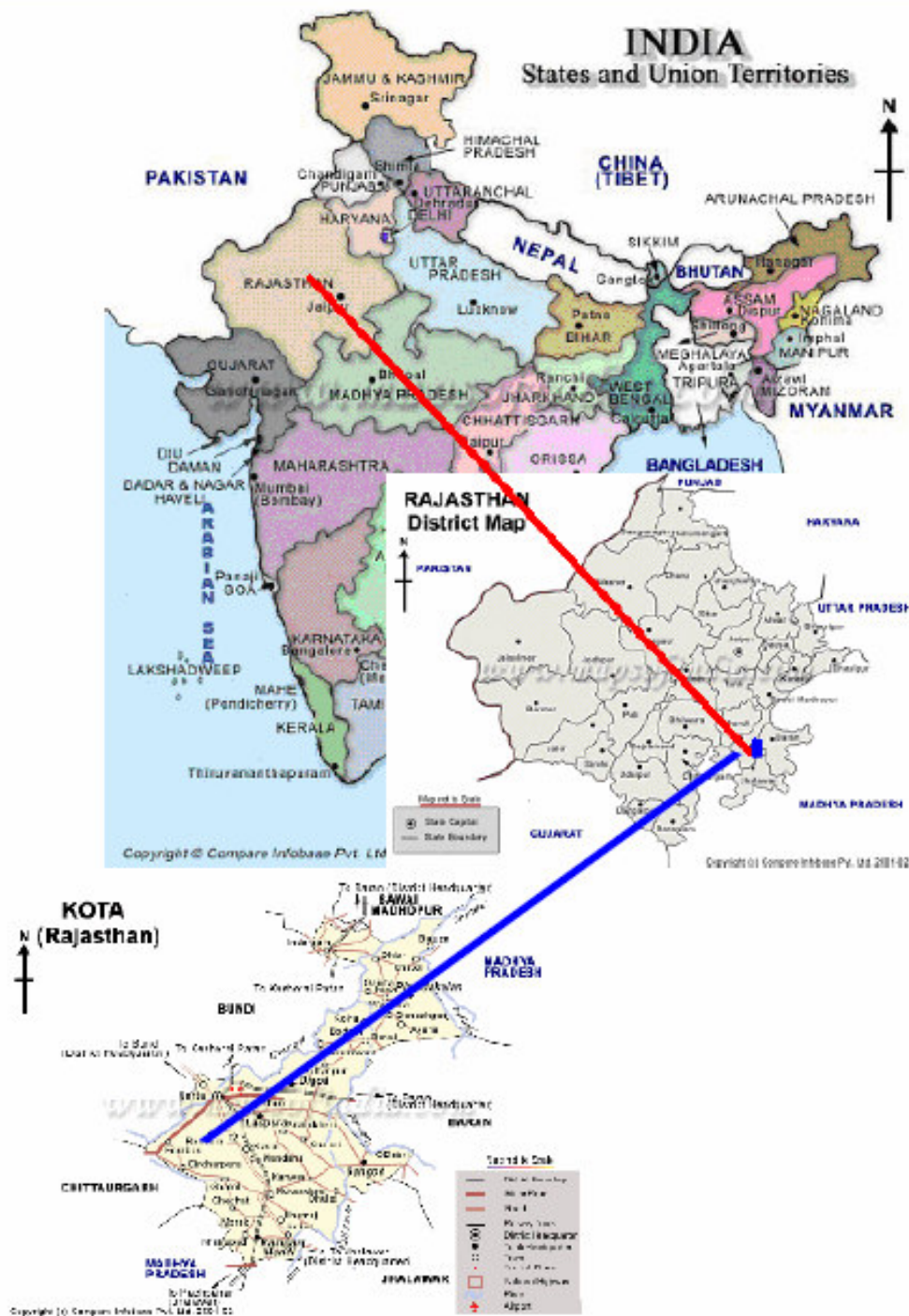
Figure 1: Location Map of Project Activity