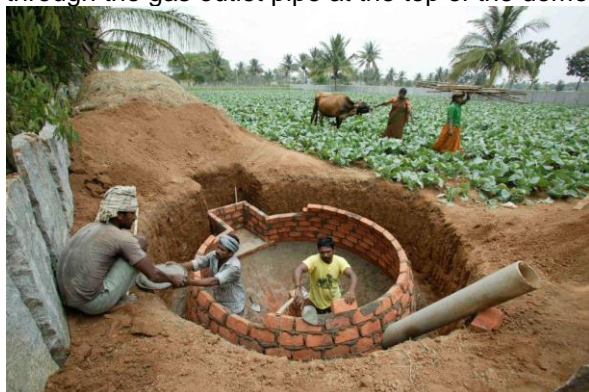
Figure 1: DeenBandhu Biogas plant model under construction.

In each household, a Deen Bandhu Biogas plant model together with a biogas-based cooking stove unit will be installed. The biogas units are constructed of bricks, sand, cement, pipes, pipe fittings, metal clips, wire and gas burners. Each bioreactor is a mesophylic fixed dome. The capacity of the bio-digesters is either 2m 3 or 3m 3 of biogas per day. The biogas unit size for a particular household is chosen based on the number and type of cattle owned by the household and the number of people in the household. Cattle dung and wastewater is fed into the biodigester daily. Cattle dung and kitchen wastewater is added to a mixing tank above ground which has an inlet pipe to a digester chamber which is below ground. The dung and wastewater slurry remains in the chamber for approximately 40 days and breaks down anaerobically producing biogas. This biogas builds up above the slurry and remains in the chamber until it is released through the gas outlet pipe at the top of the dome when the gas burner in the household is turned on.