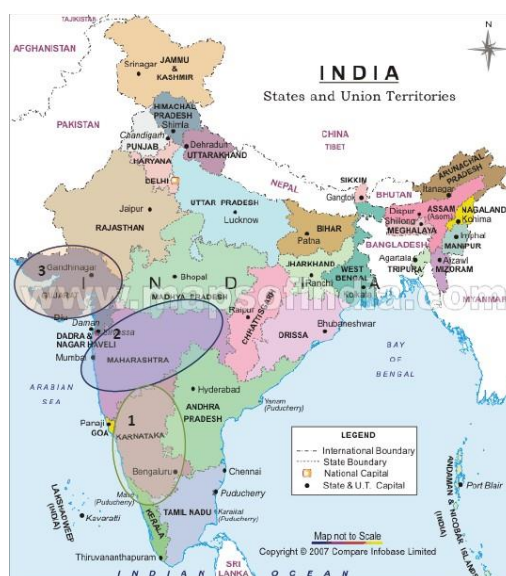
Project Activity Location, States