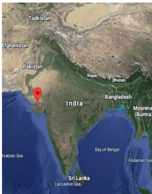
Location of Project Activity in Map