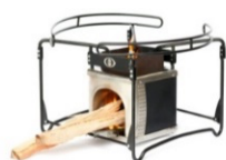
Figure 1: Econofire / SmartSaver Wood

The stove models referred above are shown below: