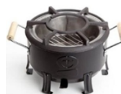
Figure 2: M5000 / SuperSaver Wood