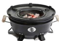
Figure 4: CH5200 - Charcoal