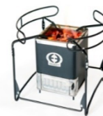
Figure 5: Econochar / SmartSaver Charcoal