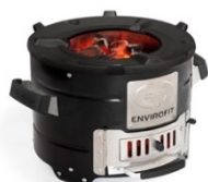
Figure 3: CH5300 - Charcoal