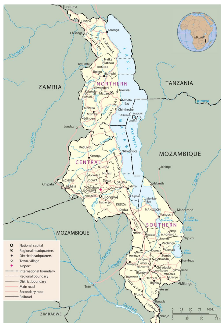
Pic. 1. Map of Malawi

0015-CP1, CPA 10182-P1-0016-CP1, CPA 10182-P1-0017-CP1, CPA 10182-P1-0018-CP1, CPA 10182-P1-0019-CP1, CPA 10182-P1-0032-CP1) are CPAs promoting ICSs in Malawi (Host Party).