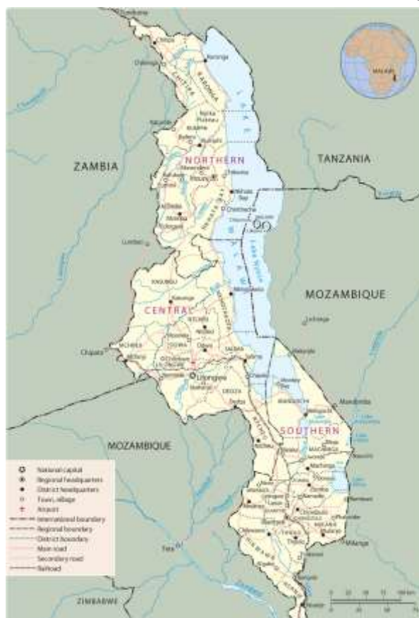
Pic. 1. Map of Malawi