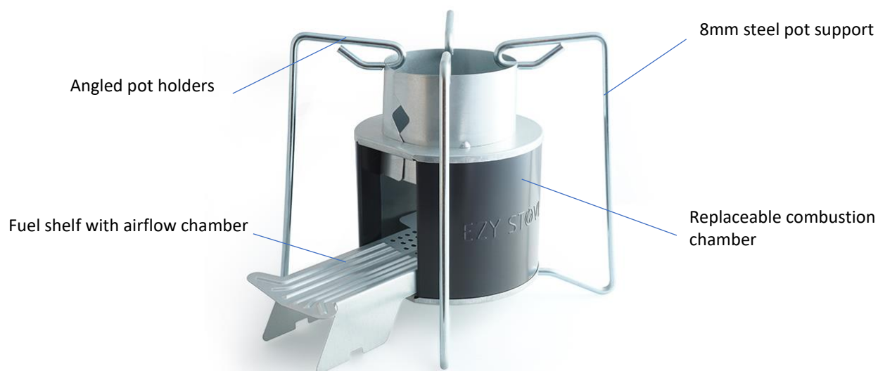
Figure 1: EzyStove Improved Wood Cookstove

The EzyStove reduces the amount of wood needed by 37.8% and the emissions of CO 2 by 69.1%, compared with a traditional three-stone fire. The outer exoskeleton creates a strong, long lasting support structure for the fire chamber, while enabling any type of pot or pan to be used. The EzyStove significantly reduces harmful smoke and wood consumption and generally cooks faster than traditional technologies.