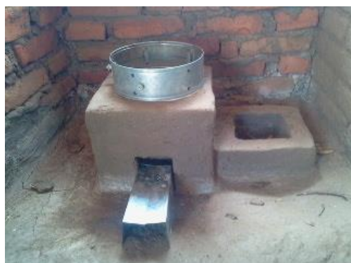
Figure 1 below shows the TLC Rocket Stove: