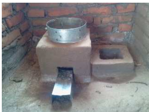
Figure 1 below shows the TLC Rocket Stove: