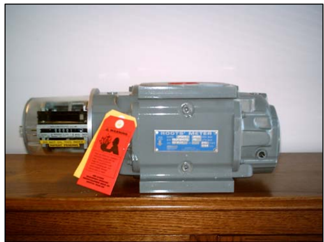
Figure 2. Roots biogas flowmeter

Biogas produced in the anaerobic digester is trapped under a positive or negative pressure geomembrane cover installed over the digester cell. The biogas is routed from the digester to the flare via PVC tubing. A flow meter, which measures gas flow, is fitted in the biogas transfer system piping.