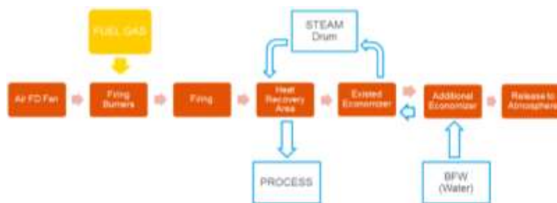
Fig: Project activity

The output of the boiler between the baseline and the project scenario remains the same. The same amount of energy (output) is generated both at the baseline and project scenario. The installation of an additional (external) economizer has a direct impact on the boiler performances since the fuel flow, necessary to produce the same amount of steam, is lower. The consequences are not only related to the higher efficiency, but lower fuel flow fired at given load means lower flue gas temperature and flow in combustion chamber and through the boiler banks. The impact is on the steam temperature.