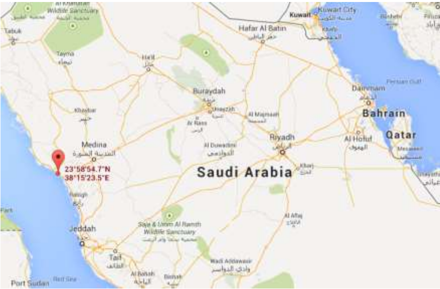
Figure A-1: Project Location