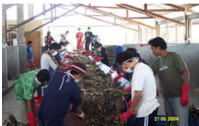
Waste separation conveyer belt