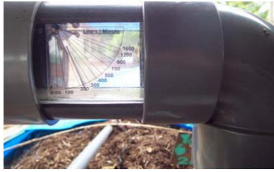
Self-made flow meters