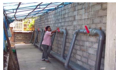
Control of laminar flow boxes