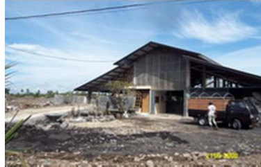
... and from the south