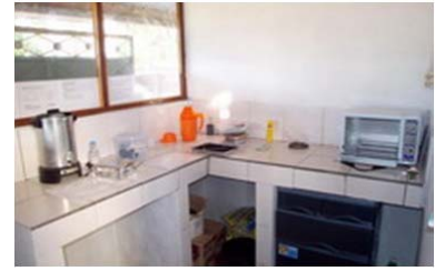
Compost analysis lab