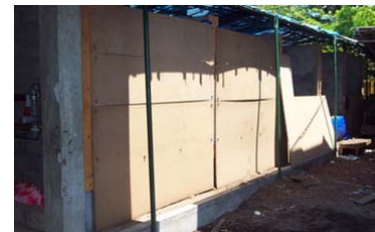
Research in boxes with laminar flow, simulating large compost tables with even conditions