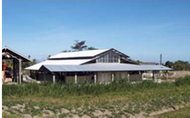
Pilot facility from the northeast