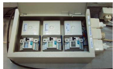
Electronic blower control