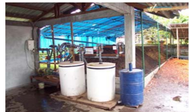
Drums for laminar research with pressure and vacuum, which is preferred by the project