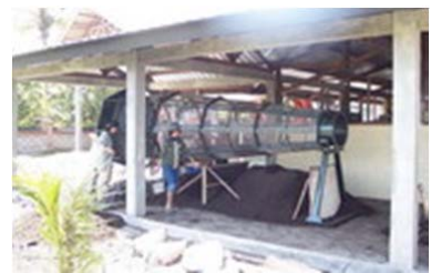
Electric compost sieve