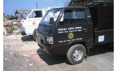
The two project trucks