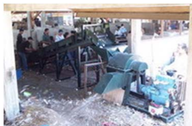
Shredder with diesel engine