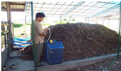
Traditional piles, where the air distributes in 2 dimension yielding very uneven conditions