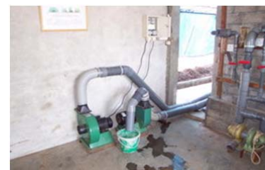
Blowers and flow controls