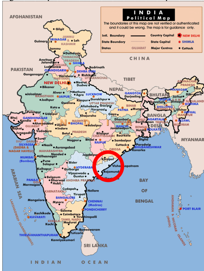
Figure 1: Map of India and location of Visakhapatnam district