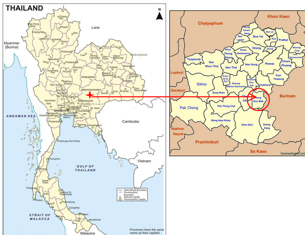
Figure 1: Maps showing the location of the project activity

According to Appendix B to the Simplified Modalities and Procedures for Small-Scale CDM Project Activities , the project type and category are defined as follows: