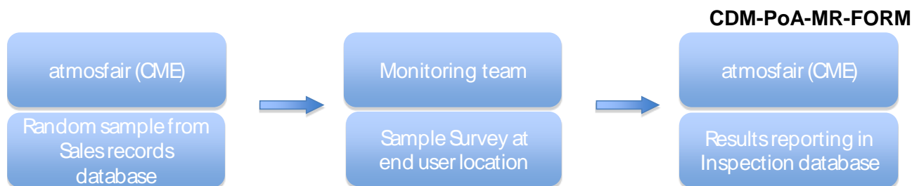
Diagram 2: Sample survey flow chart