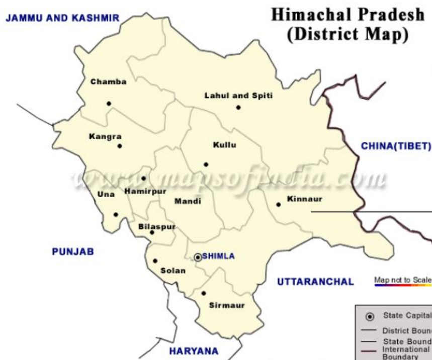
Fig- 2- showing Kinnaur districts in Himachal Pradesh state