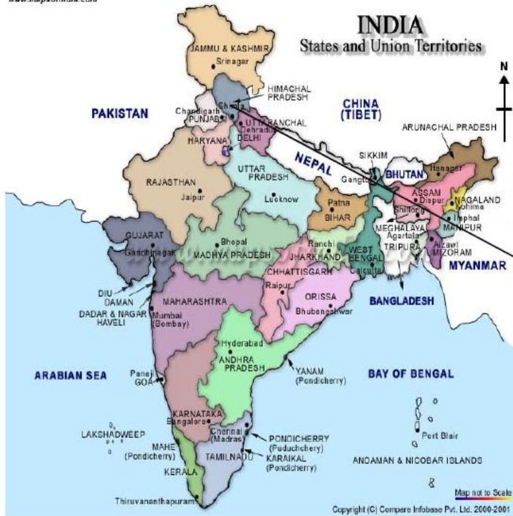
Fig – 1 showing Himachal state in Indian map