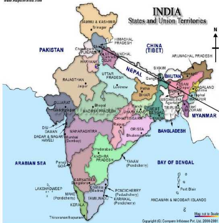
Fig - 1 showing Himachal state in Indian map