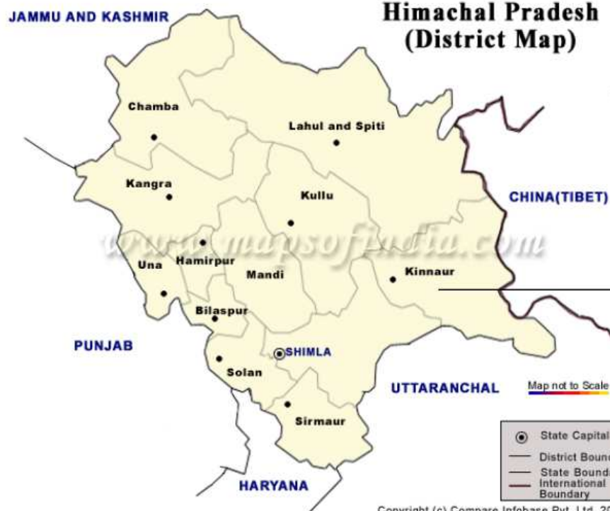
Fig- 2- showing Kinnaur districts in Himachal Pradesh state