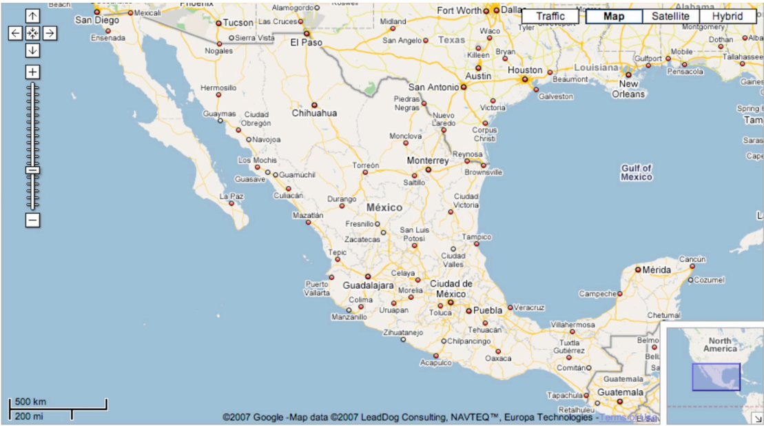
Figure 1. Map of Mexico.