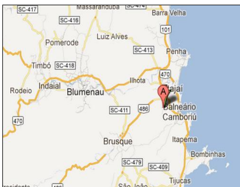
Figure 1 - Location of the project activity

(Above: Landfill location in the country on the left; satellite view of the landfill location on the right. Below: Santa Catarina State map showing location of the landfill).