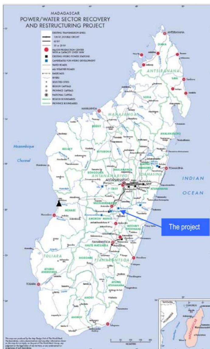
Figure 1 – The project location