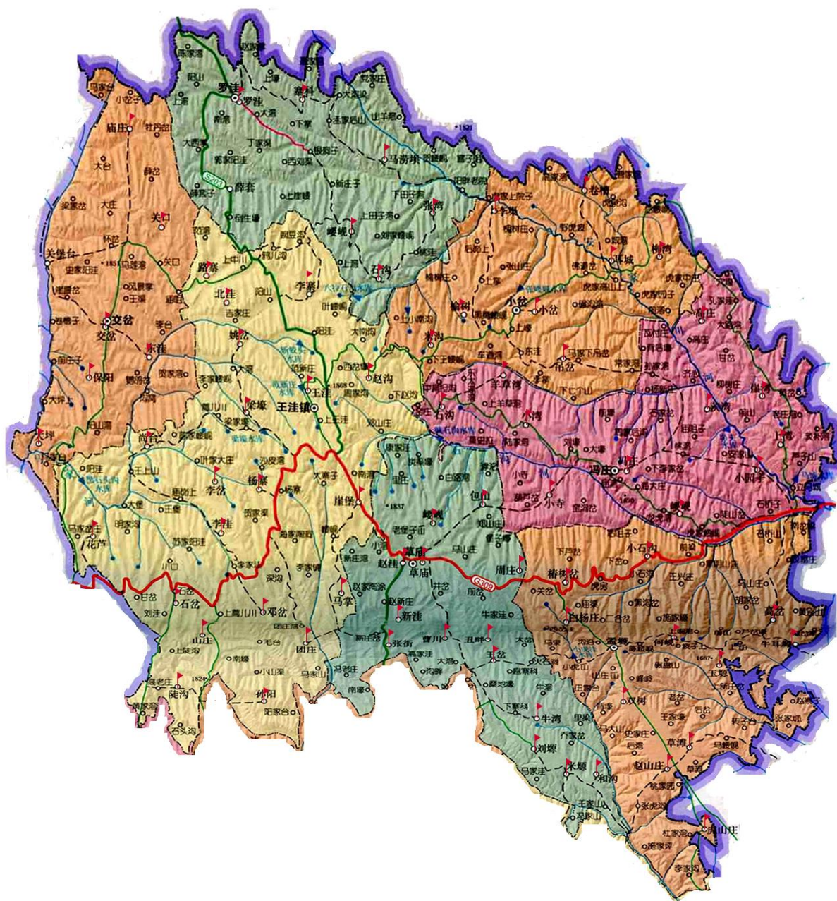
The locations and areas of the 7 townships involved in the project

The detailed locations of the villages involved in the project are marked by the red flags in the map below: