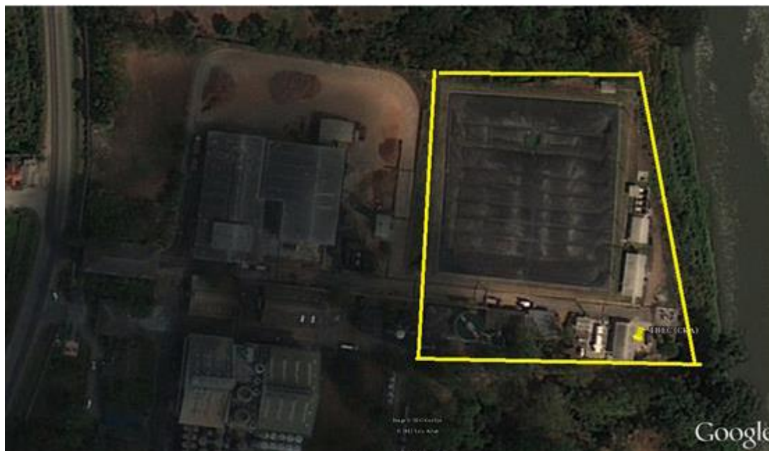
Figure 1: The geographical map of project activity