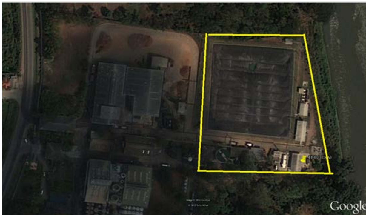
Figure 1: The geographical map of project activity