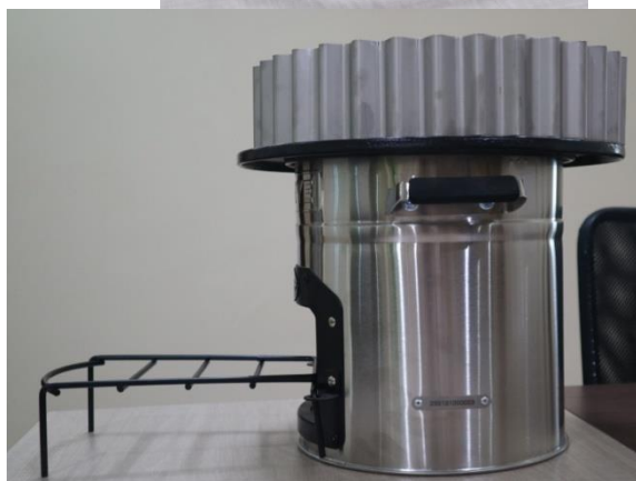
Figure 1 ICS S 26-13