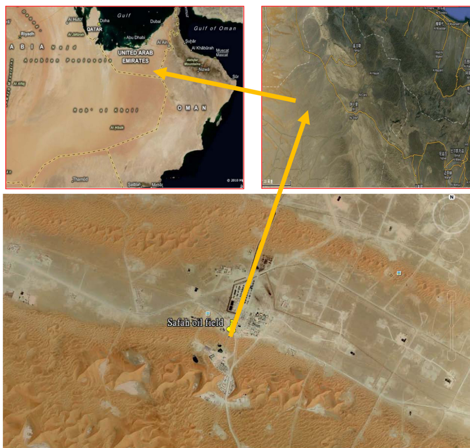
Figure 1 Location of the project