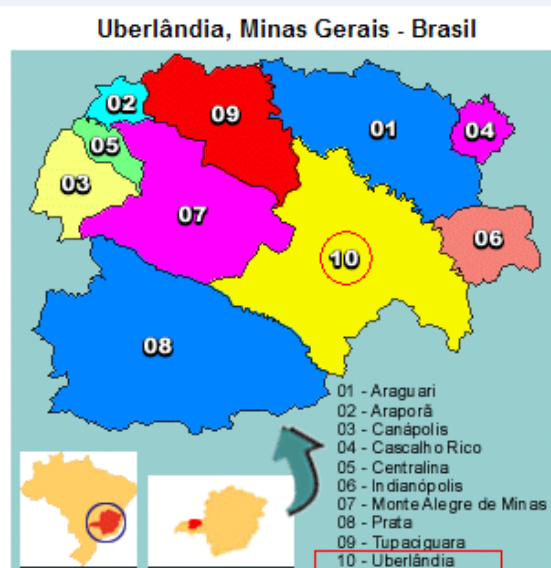
Figure 1: Geographical location of Uberlândia city.

Source: Wikipedia - pt.wikipedia.org and City Brazil - www.citybrazil.com.br 1