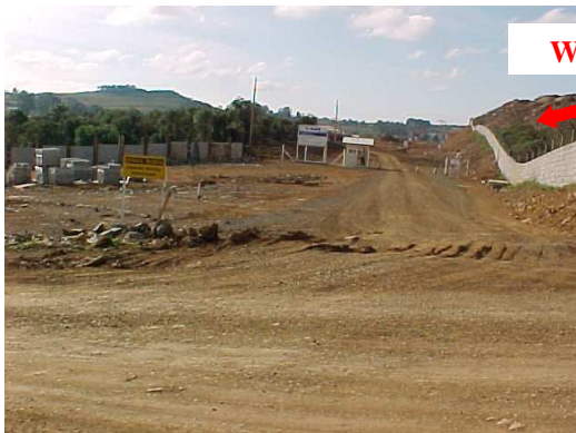
Photo 1: Lages Project entrance and in the right side the Battistella's plant limits.

in order to consider a more realistic scenario, MCF value of 0.8 is considered which is based on IPCC default for unmanaged deep waste disposal sites with depths greater than or equal to 5 meters. The Photos 1, 2 and 3 illustrate examples of how the wood waste is kept (dumped) in the absence of the Project.