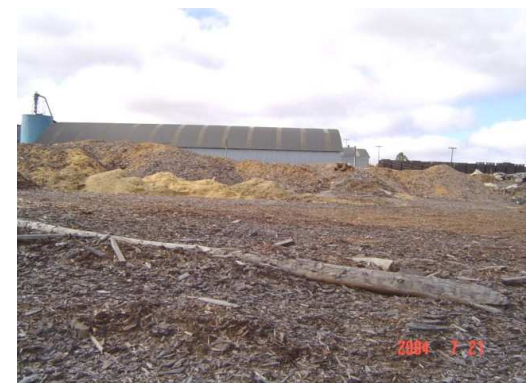
Photo 3: Wood waste disposal sites in the Lages region (spot market).

currently supplied by Lages Project, and less 370 tonnes/year burned due to conservative assumption of spontaneous combustion in its wood waste pile, as already commented in the Section B.2.