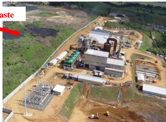
Photo 2: Lages Project aerial view.