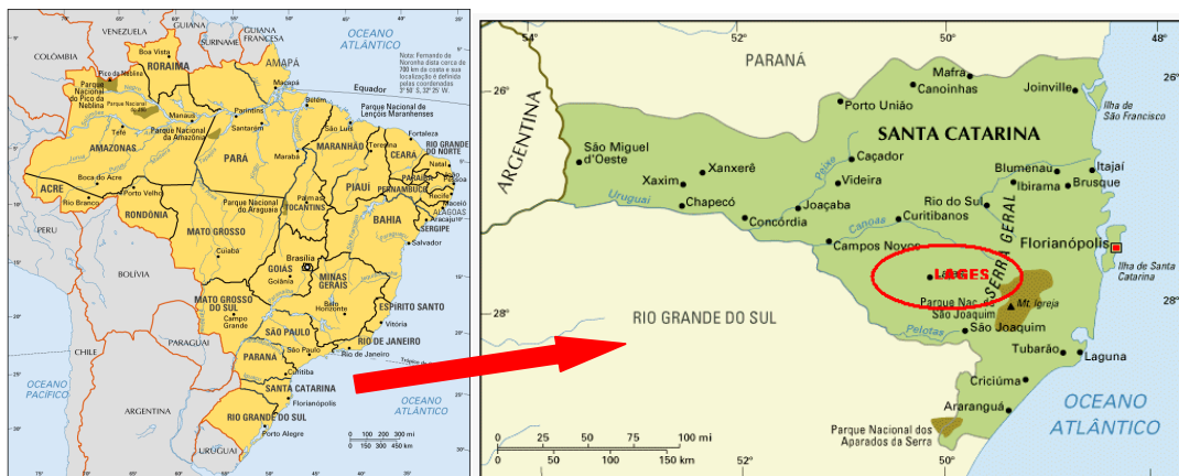
Figure 1: Geographic localization of the State of Santa Catarina and Lages municipality.

Florianópolis (the capital of the State), in the region called Planalto Serrano (Elevation: 916 m, Latitude: 27°48'58" S and Longitude: 50°19'30" W). The access to the Project by road is through BR-282 or highway BR-116, as illustrated in the Figure 2.