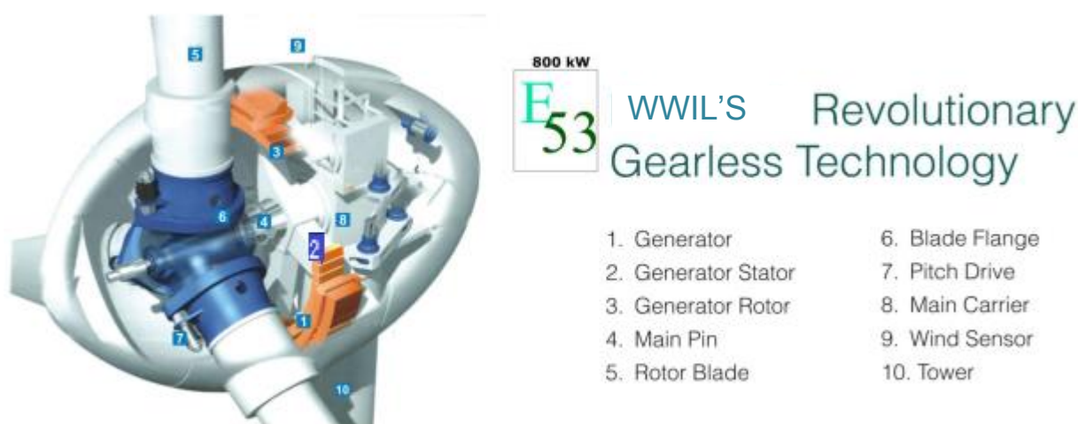
Figure: Wind World make E-53 Diagram.

Wind World (India) Ltd has secured and facilitated the technology transfer for wind based renewable energy generation from Wind World GmbH, has established a manufacturing plant at Daman in India, where along with other components the "Synchronous Generators" using "Vacuum Impregnation" technology are manufactured. Diagram of main component of Wind World make E-53 is shown in below picture:-