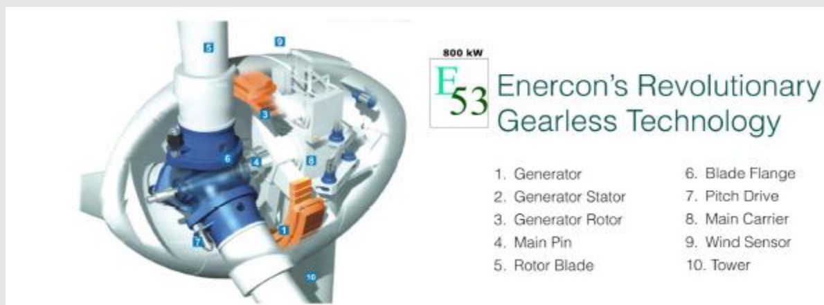
Figure: Enercon make E-53 Diagram.

Enercon (India) Ltd has secured and facilitated the technology transfer for wind based renewable energy generation from Enercon GmbH, has established a manufacturing plant at Daman in India, where along with other components the "Synchronous Generators" using "Vacuum Impregnation" technology are manufactured. Diagram of main component of Enercon make E-53 is shown in below picture:-